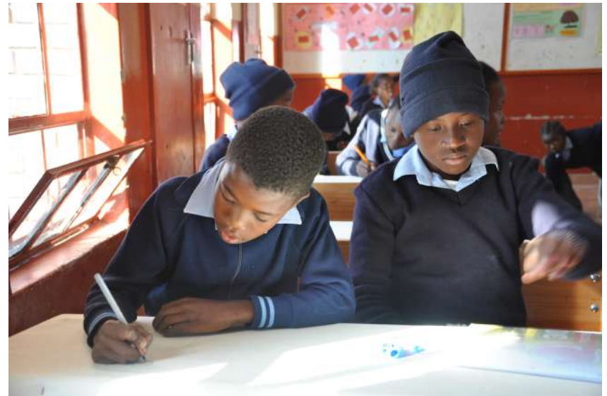
Cape Town, South Africa