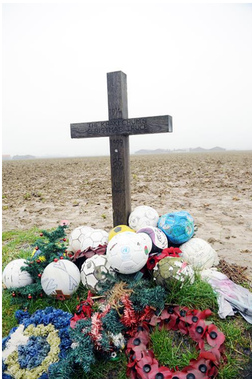
Flanders Peace Field (site of the Christmas Truces)