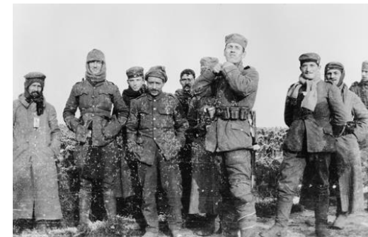
1914 Christmas Truce