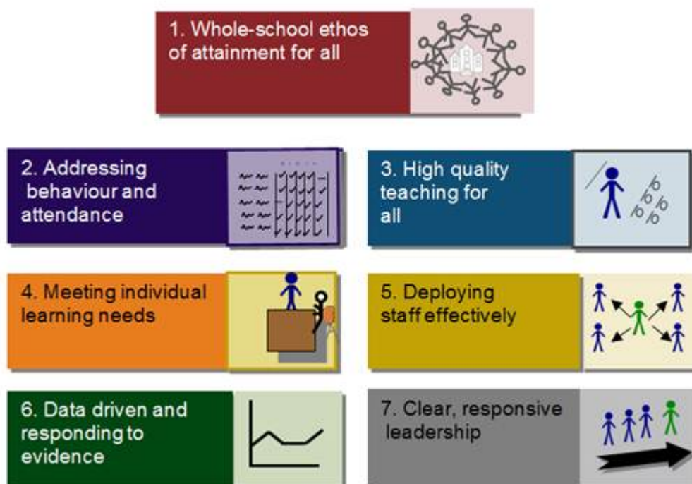
Figure 2: Building blocks for success

Based on interviews with senior leaders from more and less successful primary, secondary and special schools, the NFER research found that schools which are more successful in promoting high attainment have a number of things in common. It identified seven building blocks of success.