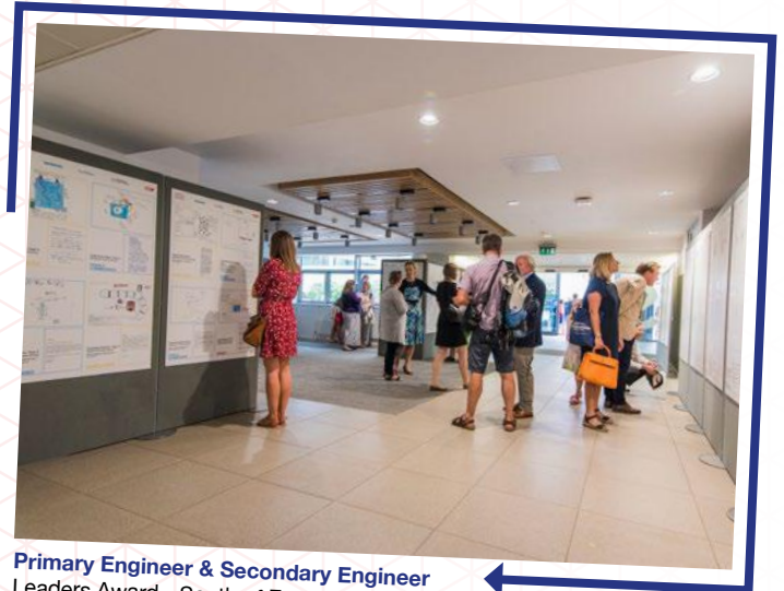
Primary Engineer & Secondary Engineer Leaders Award - South of England 2017 exhibition