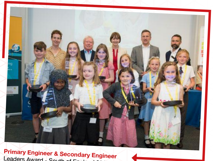
Primary Engineer & Secondary Engineer Leaders Award - South of England 2017 winners

These letters provide teachers with the opportunity to explore: